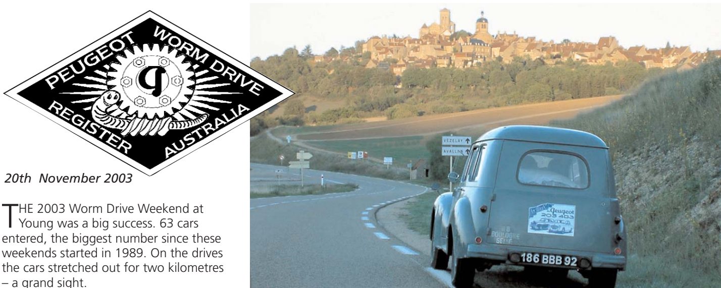
A 203 break on the road in France with a 12th century basilica in the background.

entered, the biggest number since these weekends started in 1989. On the drives the cars stretched out for two kilometres