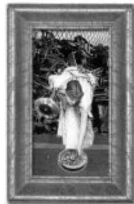
Saint Cassé of wrecking yards