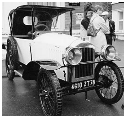
This early twenties 161 also has a worm drive.