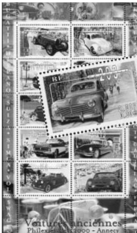
A current issue of French stamps features the 203

IF you have parked a 203 or even a later Peugeot there is an even chance that someone will come up to you and say that "I had one of those" or "My Dad had one of those". In an old car magazine, a cartoon showed an elderly local waving his stick at an old car outside a pub. "My old dad had one of those. Right load of rubbish it was." Which is an interesting twist. The pub was very English and so was the car. So we could all agree.