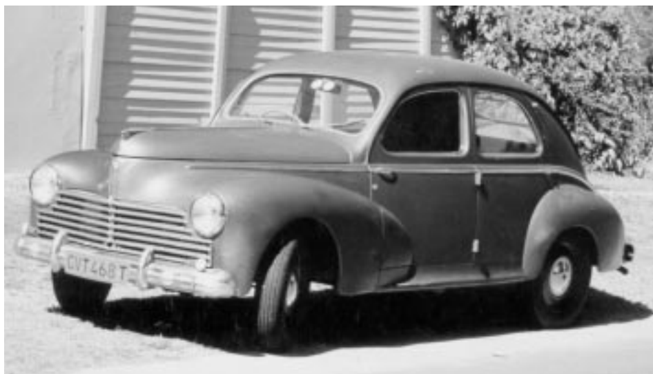
Francois Swanepol's 203 minus seven women, two babies and a Miniature Schnauzer.

Bought in a market in Tunisia, this key rack is made from an oil can.