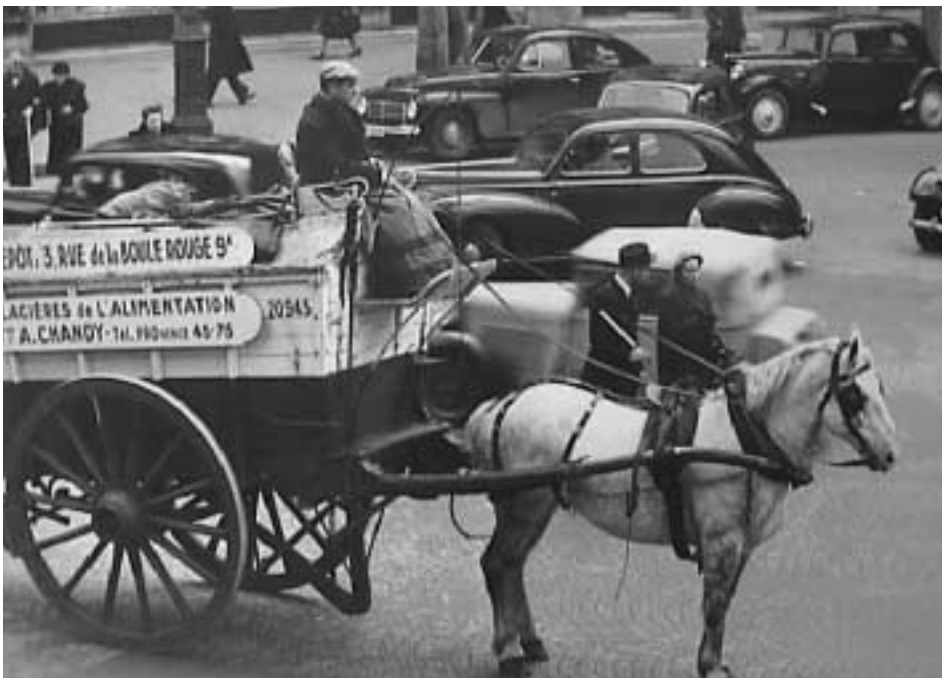
Interesting picture from the early days of the 203. And an early Volvo in the background. The cart is delivering ice for keeping food cool.

THE 2001 WORM DRIVE WEEKEND will be held at MALDON in northern Victoria NOVEMBER 9TH, 10TH & 11TH Full details next month