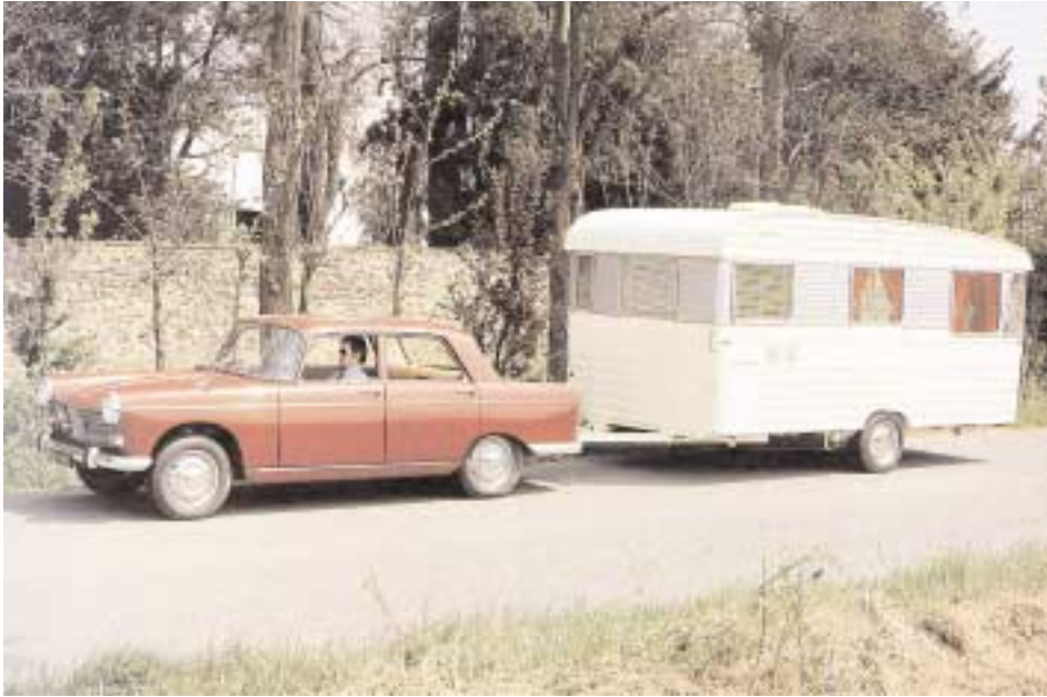
404s could pull a caravan. My father-in-law towed one to Queensland every year for the winter with his 404. Probably easier than with those 6 cylinder cars with 3-speed gearboxes and no synchro on first.