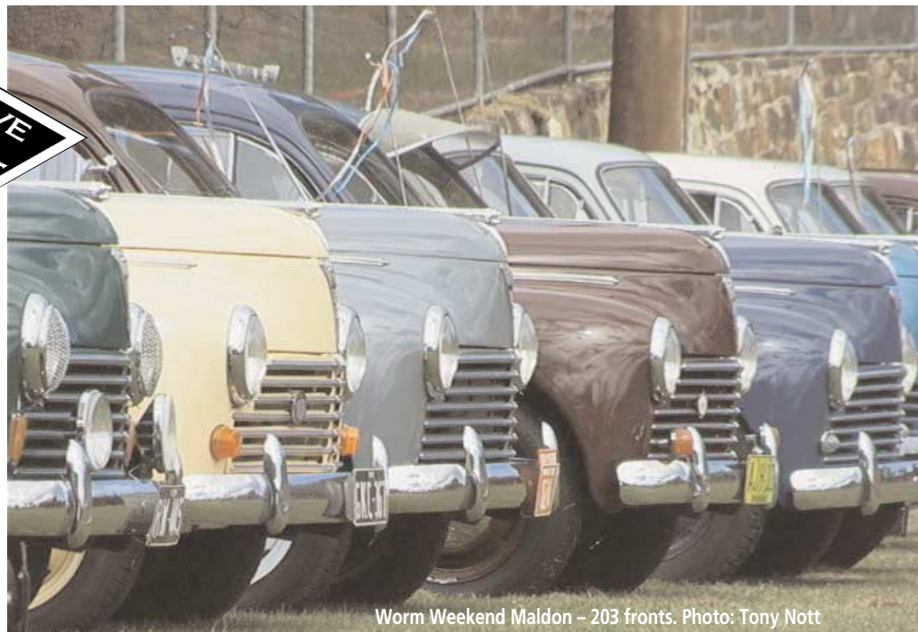
Worm Weekend Maldon – 203 fronts.

The goodies bag included a pair of disposable overalls for entrants as