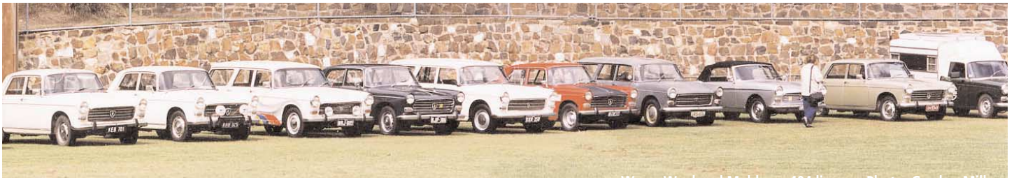
Worm Weekend Maldon – 404 line up.