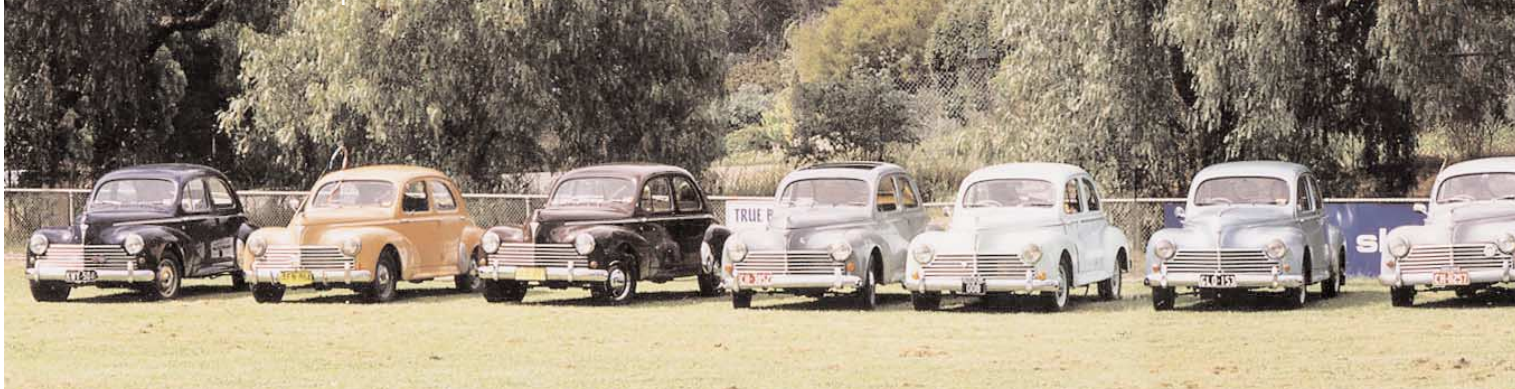
Worm Weekend Maldon – 203 line up.

Thank you all for the support over the years. It has been great fun and I have made a lot of good enduring friends.