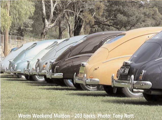
Worm Weekend Maldon – 203 backs.

lens. Same as the top red lens only orange. Available from Fischer Veteranen Service in Frankfurt.