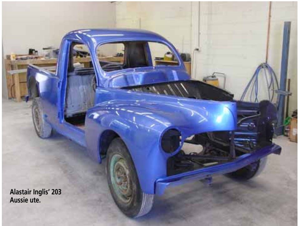
Alastair Inglis' 203 Aussie ute.