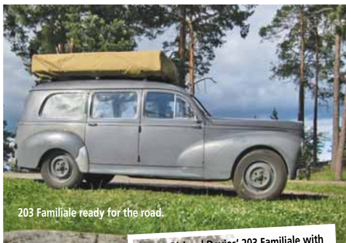
203 Familiale ready for the road.

I am not aware of a 203 Familiale in Australia only 203 station wagons. The Familiale seats six. The extra seats are not the 3rd row as in later models but are tip up seats in the second row.