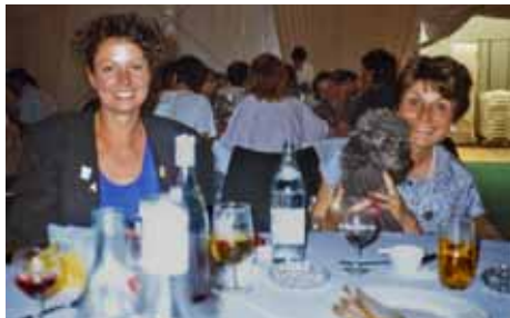
The Swiss ladies at Sochaux in 1990.