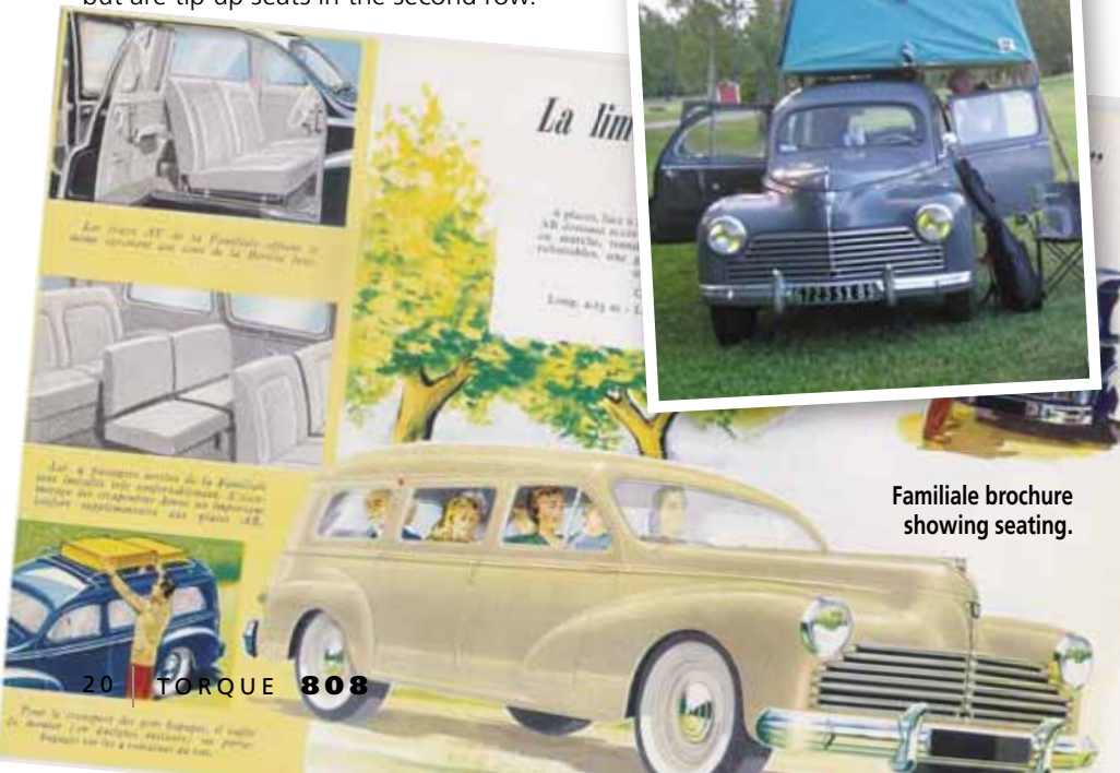
Familiale brochure showing seating.