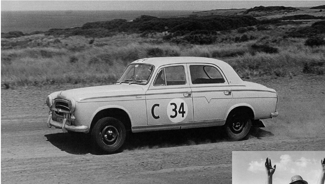
A Peugeot 403 came second outright, and won class C, in the 1960 "Armstrong" 500 mile race held at the Phillip Island circuit.