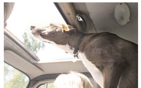
Christina Alvner's new dog likes sniffing the Swedish summer air through the open sunroof of her 403.

external mirrors of the 404 cabriolet while in the garage. Small bird poo! Then I caught them at it. The pair of scrub Wrens were sitting on the mirror having a conversation with their reflections. The outer part of my garage used to be a carport and the back door has a ventilation grill in the bottom. They were flying in and out through the grill.