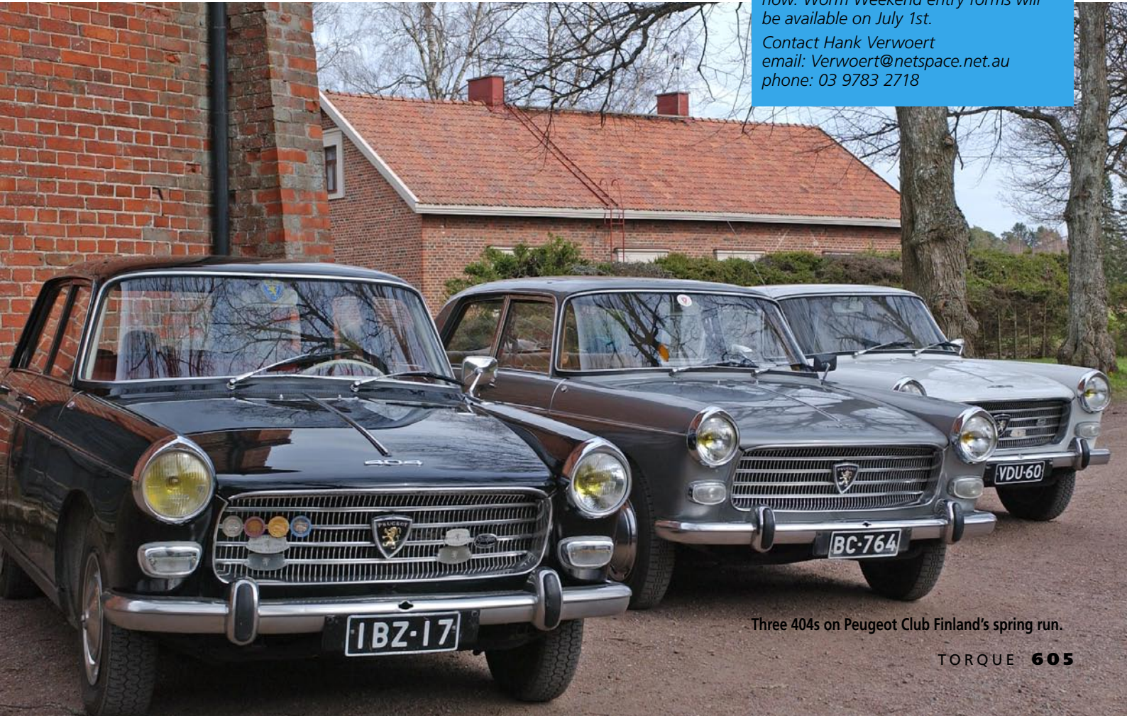
Three 404s on Peugeot Club Finland's spring run.