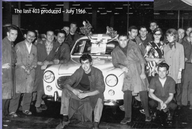
The last 403 produced - July 1966.