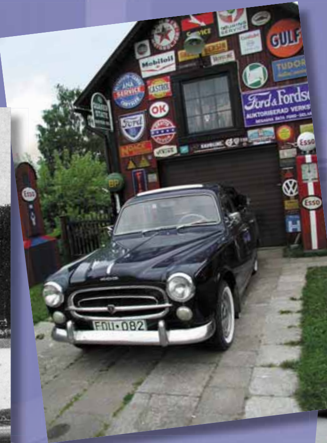
Geoff Russell's 403 came second outright at the first Armstrong 500 in 1960, the forerunner of the Bathurst 1000.