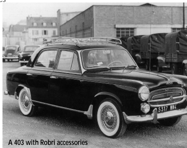
A 403 with Robri accessories

Robri made a big range of cast aluminium trim pieces for the 203 and 403. The stone guards on the rear mudguards of 203s are a Robri part. A Paris foundry is reproducing many of these parts. Plain castings only. They need to be polished etc. Email them on fonderie.denous@wanado.fr and they will send you a price list plus an illustration of the parts.