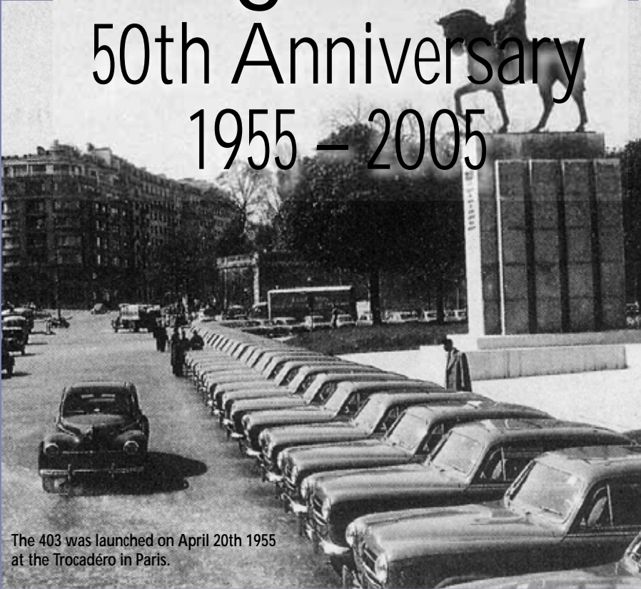
The 403 was launched on April 20th 1955 at the Trocadéro in Paris.