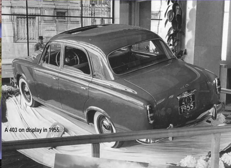
A 403 on display in 1955.