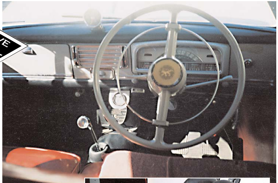
Above: The interior of the 403 that was once powered by that unique Peugeot V8 engine.

I have just heard that the car also still exists. Jim Hawker made the engine. The engine is now in a car museum. A letter I have received enclosed a picture of the interior of the 403 the V8 was fitted into, showing the floor gear change and the extra instruments. The car now has a normal 403 engine. Two pieces of Australian Peugeot history that should get together again.