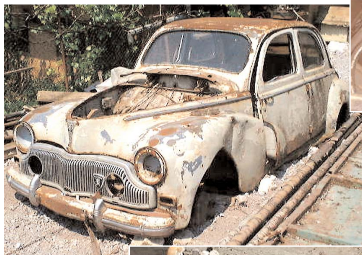
Left: The original supercharged 203, more recently used as a "dog kennel". Below: The special 203 alloy wheels were eventually discovered on a nearby farm cart.