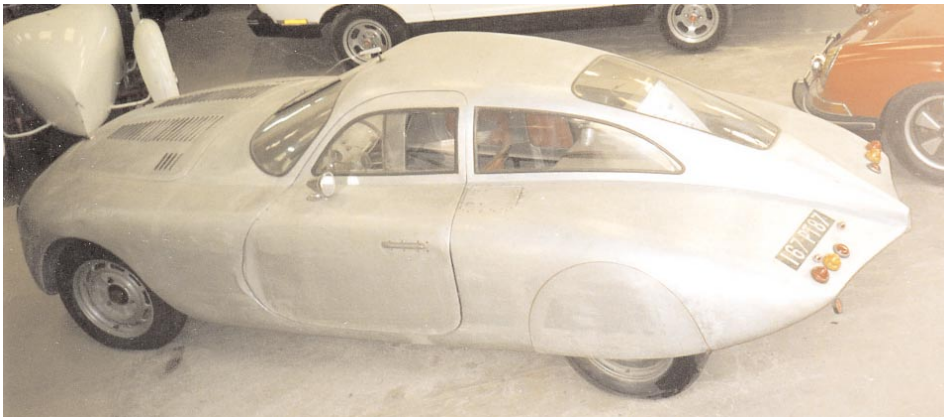
Photos of a one-off 203 special built by Emile Darl'Mat which he intended to race at Le Mans in 1954.

Two weeks later a hand built 1/43 model of the car was put up for auction on Ebay. I watched the auction but a final price of US$140.00 was more than I was prepared to pay.