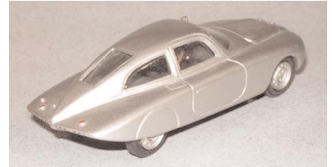
The 203 Darl'Mat model sold on Ebay.