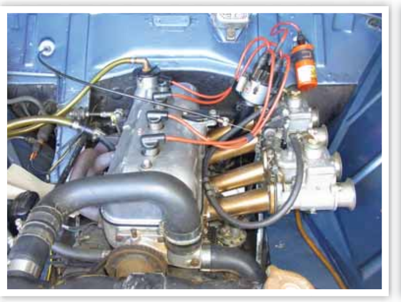
Ken's outstanding 403 engine.